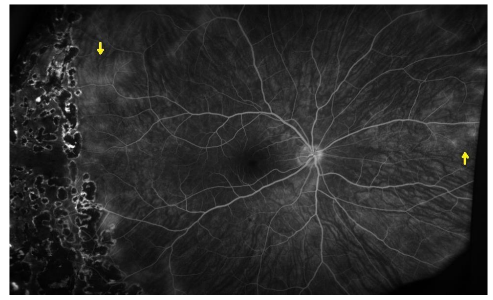
Figure 1: Widefield Fluorescein Angiogram (WFA) of the right eye showing new, worsening hyperfluorescence – a marker of capillary inflammation termed latephase angiographic posterior and peripheral vascular leakage (LAPPEL; yellow arrows), despite previous laser treatment. Also noted are areas of capillary dropout and some straightening of blood vessels. Worsening LAPPEL is often an indication for treatment with photocoagulation.

Widefield fluorescein angiography (WFA; Figure 1) of the right eye conveyed vascular changes called late-phase angiographic posterior and peripheral vascular leakage (LAPPEL), that were new compared to the quiescent WFA six months prior. There was a mild epiretinal membrane without edema on optical coherence tomography imaging (Figure 2). After a thorough discussion of the findings, as well as all treatment options, the decision was made for fill-in panretinal photocoagulation (PRP) in the right eye.